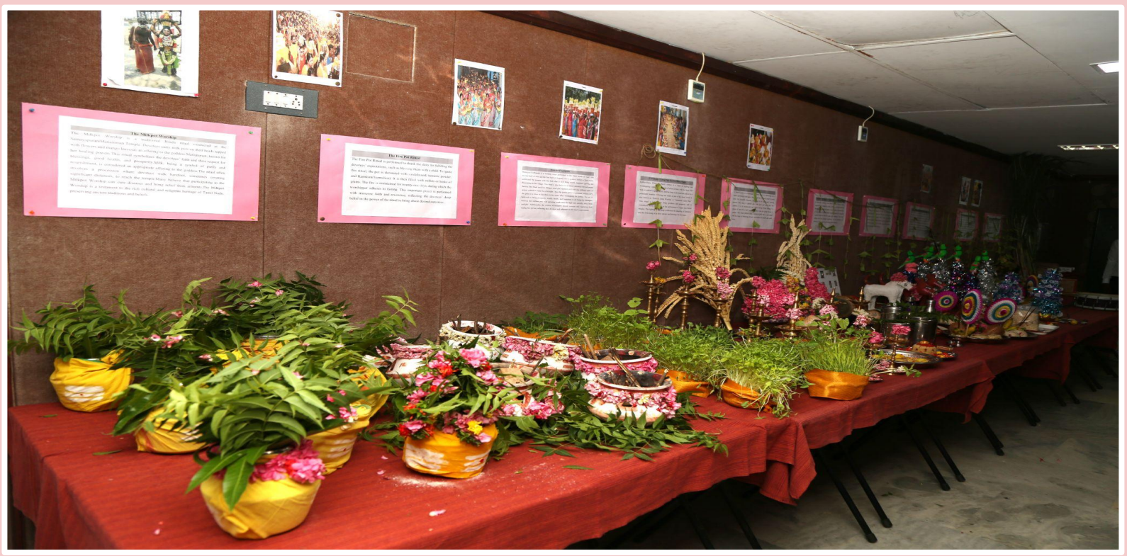
Exhibits of the Seminar to showcase the Uniqueness of Sri Marianman Cult